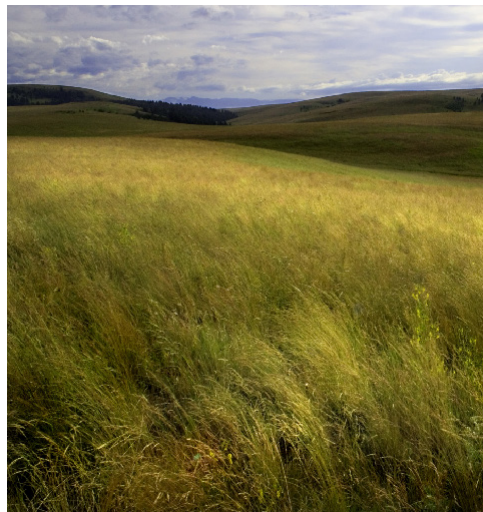
The Oregon Grasslands Project

Among the projects we're investing in is the Lightning Creek Ranch project in the State of Oregon, preventing the loss of North America's largest bunchgrass prairie. The investment would help landowners prevent farming that land and enhance natural carbon removal systems.